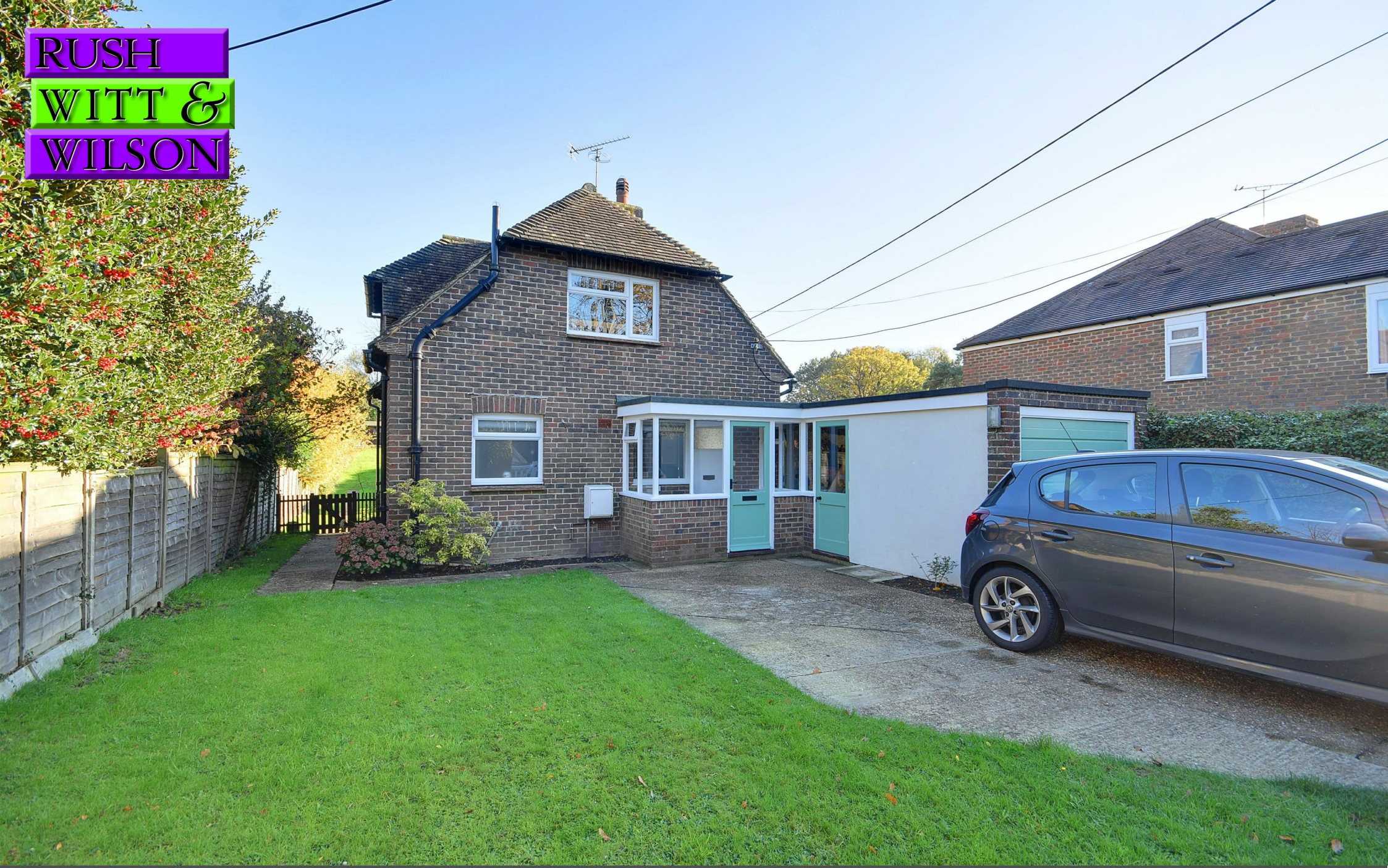
Hollowfield, Ewhurst Lane, Northiam, East Sussex, TN31 6PA. £385,000 OIEO Freehold